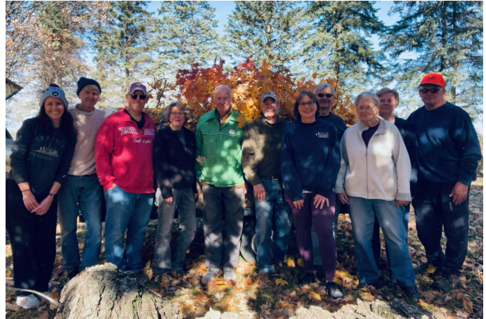
Cemetery clean-up/tree trimming crew!